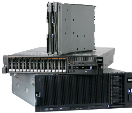
Blade Center X5 System x3690 X5 System x3850 X5

IBM System x3850 X5, x3690 X5, and BladeCenter HX5 are available as 4-, 6-, or 8-core systems and incorporate up to 1TB of memory per chassis (plus an additional .5TB with the MAX5), the largest snoop filter in its class, virtualization hardware assists, enterprise-class scalability, reliability, availability, flexibility, and record-setting performance.